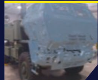
Design & QA on Vehicles